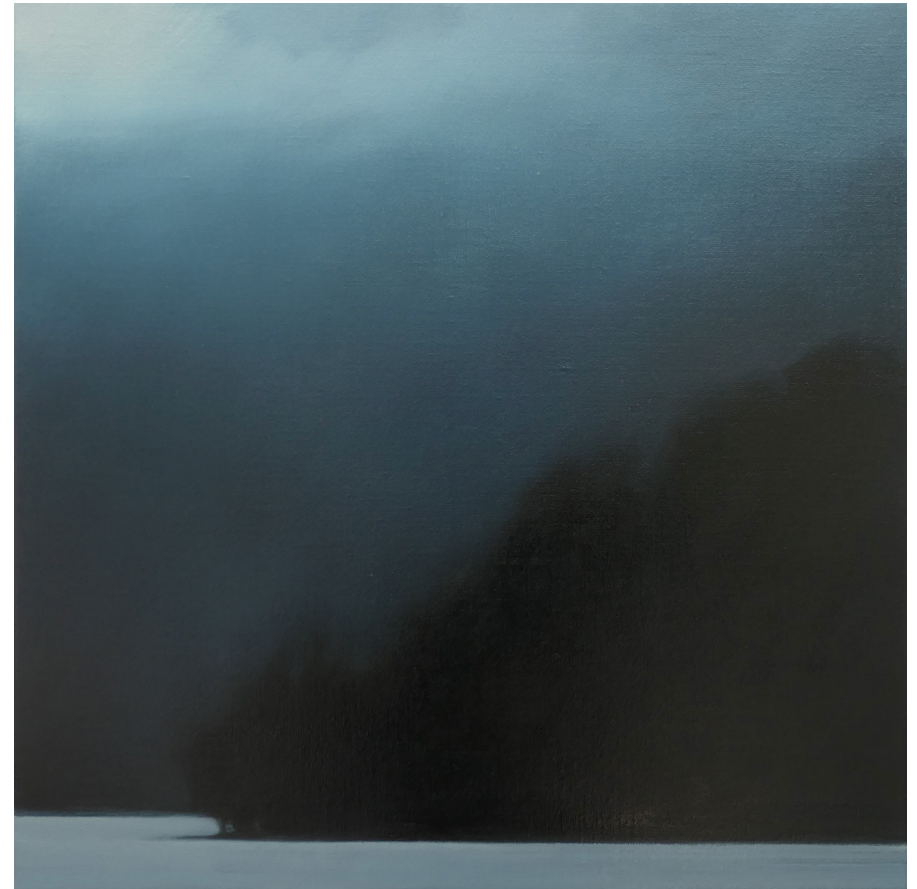
Hawkesbury Reaches | 61x61cm | Oil on linen | 2020

The vision we see before us, is a combination of real, experienced landforms, and the landscapes of the psyche. The lines have been blurred, but in shifting the traditional emphasis between sky and land we are provided with a clue that what we see here is less a document of the real than a compelling portrait of the mind. The actual location of the landscapes is not important.