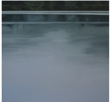
River and Light | 107x107cm Oil on linen | 2020