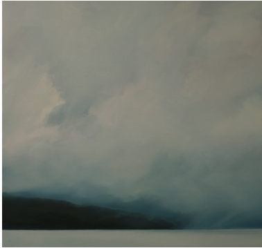
Hawkesbury | 107x107cm Oil on linen | 2020