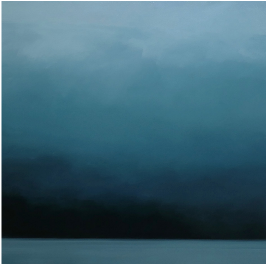
Hawkesbury. Blue Grey | 107x107cm | Oil on linen | 2020

The vision we see before us, is a combination of real, experienced landforms, and the landscapes of the psyche. The lines have been blurred, but in shifting the traditional emphasis between sky and land we are provided with a clue that what we see here is less a document of the real than a compelling portrait of the mind. The actual location of the landscapes is not important.