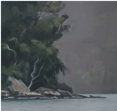
Rivers Edge | 61cmx61cm Oil on linen | 2020